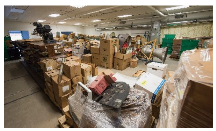
A Small Part of Jay's Collection in Storage

AT ERNIE'S SEAFOOD 8206 BEDFORD EULESS RD., NORTH RICHLAND HILLS, TX 76180-7214