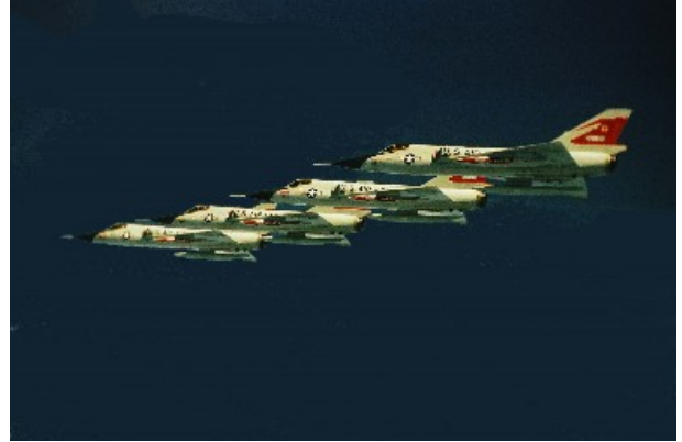
A Flight Up of F-106s